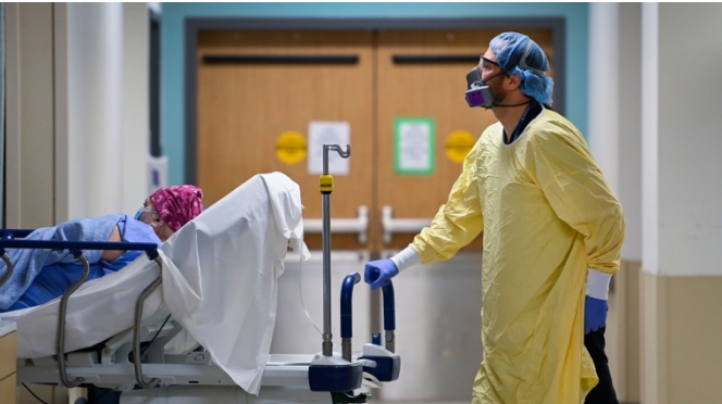
Frontline health-care workers, protected by reusable PPE gowns from Ecotex treat an intubated patient at Sunnybrook Health Sciences